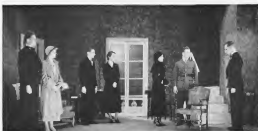
-Three Faces East-March, 1933